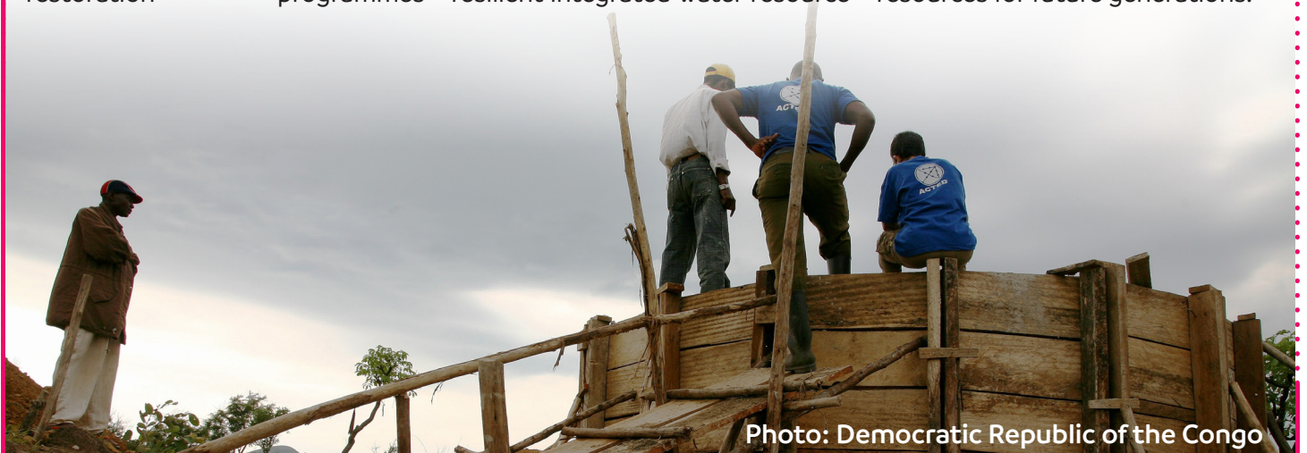
Photo: Democratic Republic of the Congo

management (IWRM) to address growing pressure on groundwater. This includes strengthening institutional capacities, improving monitoring systems, developing predictive models, and integrating climate data into planning. By combining improved governance, climate-resilient infrastructure, and climate-smart agriculture and ecosystem-based practices, Acted contributes to reducing water demand and safeguarding water resources for future generations.