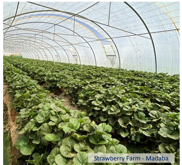
Strawberry Farm - Madaba

The average yield at the selected strawberry farm is 7 ton per layered green house and 4 ton per traditional green house.