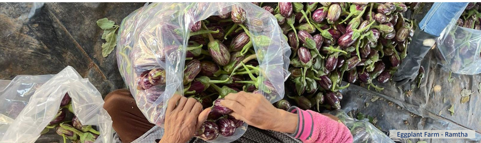
Eggplant Farm - Ramtha

While each farm has different characteristics and agricultural practices, they all share several features and approaches. All farms report being consulted by other farmers on agricultural activities and frequently provide advice to their fellow farmers. Many of these farms also participate in community and farmers markets and they support other local farmers through educational workshops, mentorship programs, and resource sharing. All 8 farms are centrally located, offering easy access for small-scale farmers.