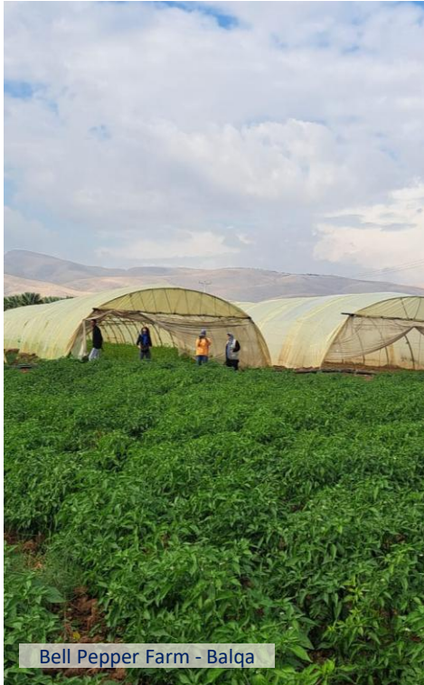
Bell Pepper Farm - Balqa