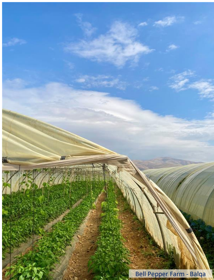
Bell Pepper Farm - Balqa

The eight selected farms primarily target sales points within their governorates, focusing on local markets such as farm gate sales, hypermarkets, and central markets. While the okra farms do not target markets outside their governorates, the other farms do. Notably, the two bell pepper farms and the strawberry farm engage in international sales, with all of them exporting to regional and international markets through trade fairs and established buyer networks. All farms have undertaken initiatives to expand their market presence and connect with wider audiences. These efforts include hosting farm tours and events to showcase their produce and practices, participating in trade shows and exhibitions, and engaging in local bazaars to increase visibility. Additionally, the two bell pepper farms and the strawberry farm have attended international trade fairs to try and establish connections with buyers and stakeholders abroad. Some farms have also adopted tailored strategies, such as offering home delivery services (the Okra farms) and exploring other innovative marketing approaches.