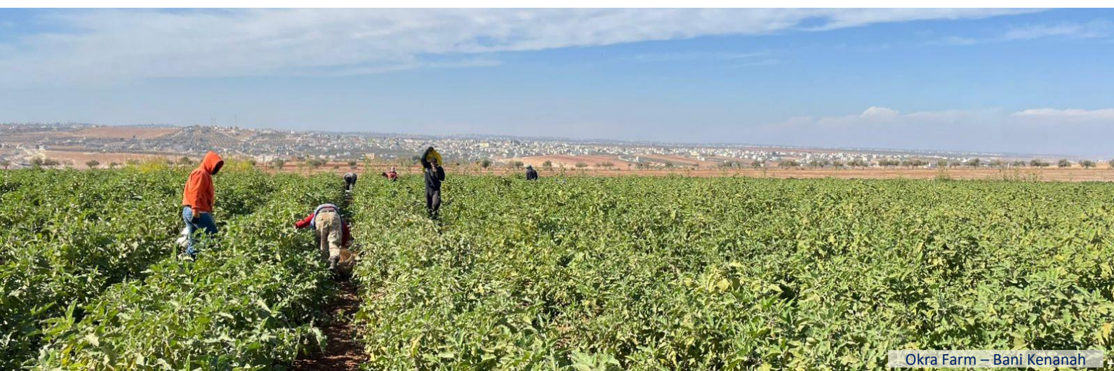
Okra Farm – Bani Kenanah