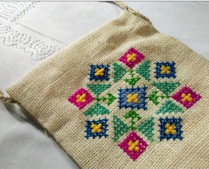
Examples of handicraft products created by beneficiaries, supported by ACTED-BPRM project