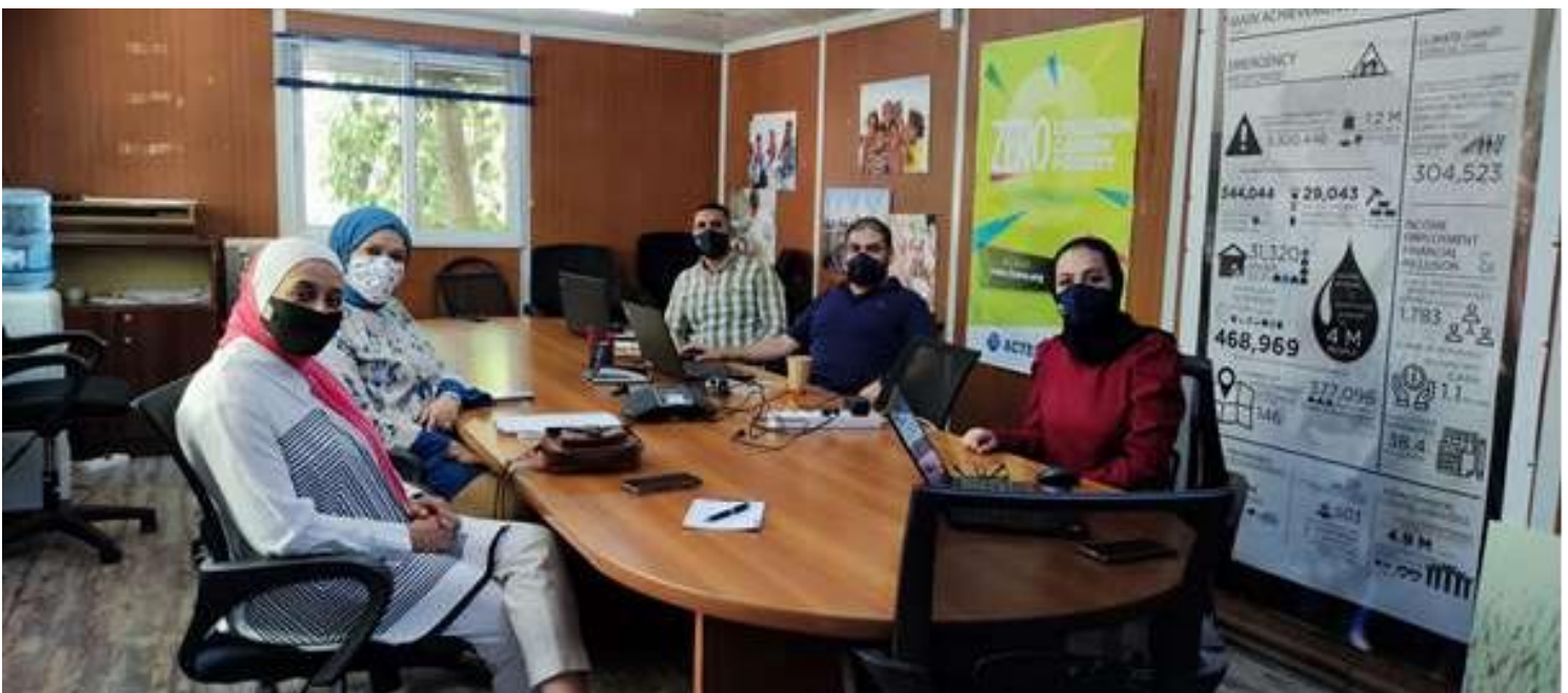
Photo: On August 5th 2021, ACTED conducted a capacity building training on financial reporting for its local partner, the Jordan Environment Union.

The advocacy and networking capacity of CSOs will be developed through the creation of two thematic working groups (one in East Amman and one in Karak), aimed at discussing sectors' policies at local and national level. ACTED will also support one advocacy project and cover its implementation costs up to 15,000 EUR. Moreover, building on Phenix's existing online platform , ACTED will further promote networking and coordination among CSOs by providing updated information on CSOs activities and funding opportunities.