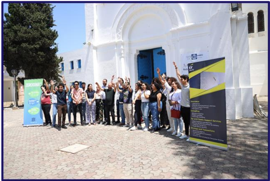
Closing ceremony of boot camp in Carthage, June 2023

We are all concerned. The good news is that it's we who have the power and the responsibility, as citizens, consumers, producers and decisionmakers, to reverse these trends and build a world of zero exclusion, zero carbon and zero poverty . This is what 3ZERO is all about: joining forces across borders, generations and sectors to reinvent a society on a human and environmental scale, preserving humanity and our planet for generations to come. We won't stop until we reach ZERO .