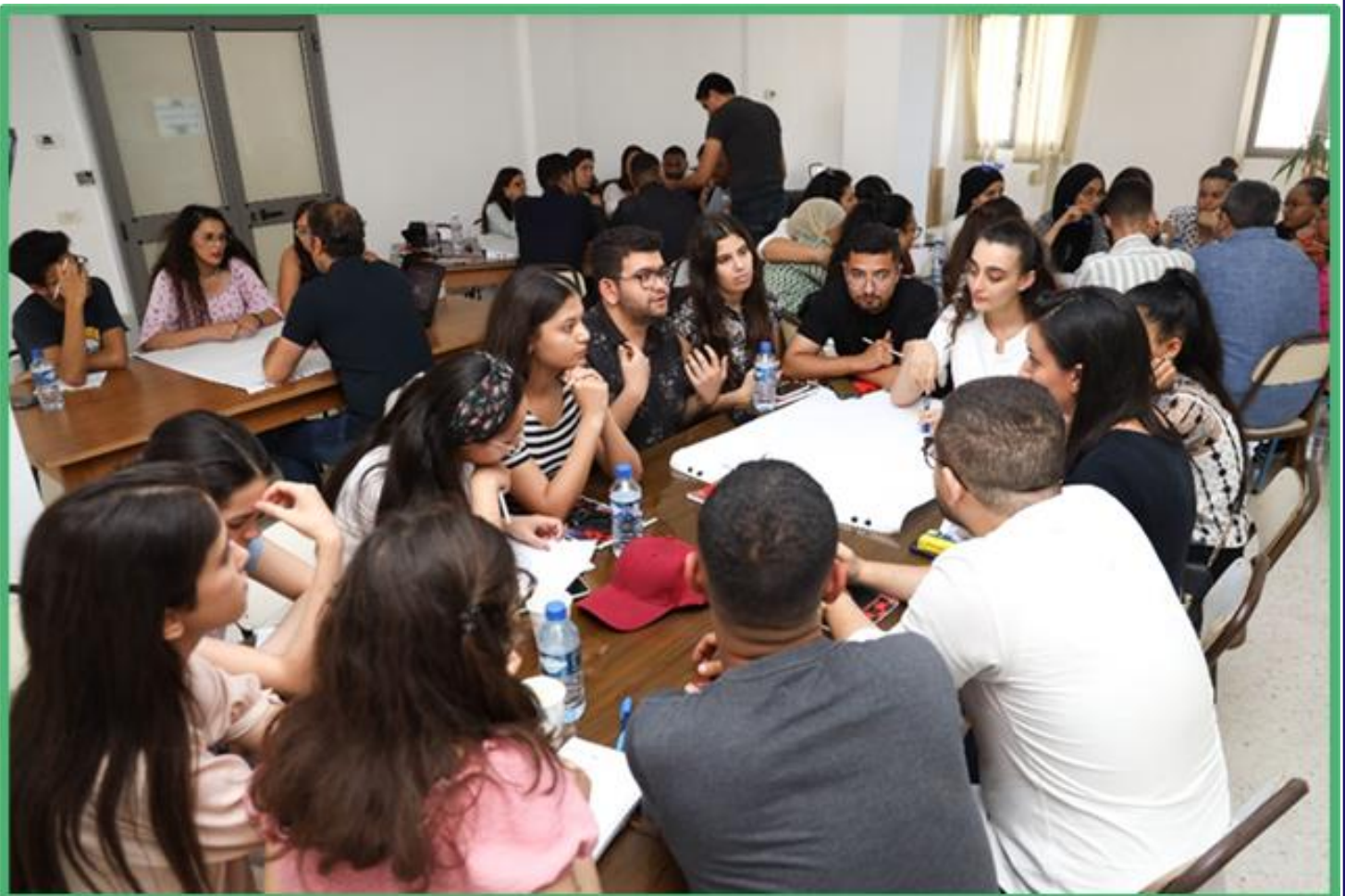
Boot camp, business plan training and round table at the FSEG in Sousse. June 2023

this quest, Acted and WLS have joined forces, sealing a strong partnership, with the aim of setting up an innovative 3ZERO House. This house will house an incubation service designed to support the launch of the most promising 3ZERO projects. Together, we'll break new ground, reinventing possibilities and bringing the boldest dreams to life.