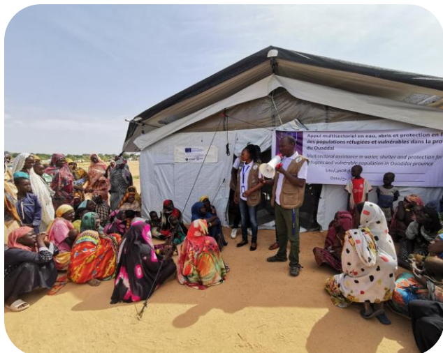
GBV awareness session by ADRAH, August 2023, Ouaddaï.

36,000 people sensitized to protection and GBV