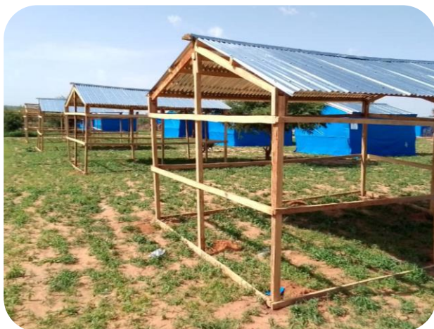
Construction of family shelters by Acted, July 2023, Ouaddaï