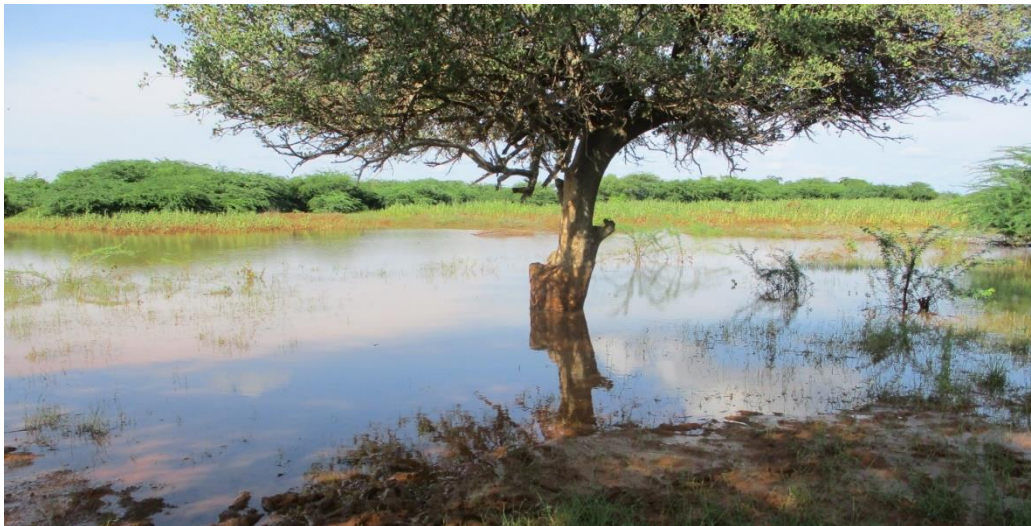
Shimbirole crops destroyed by the floods, October 22 2019