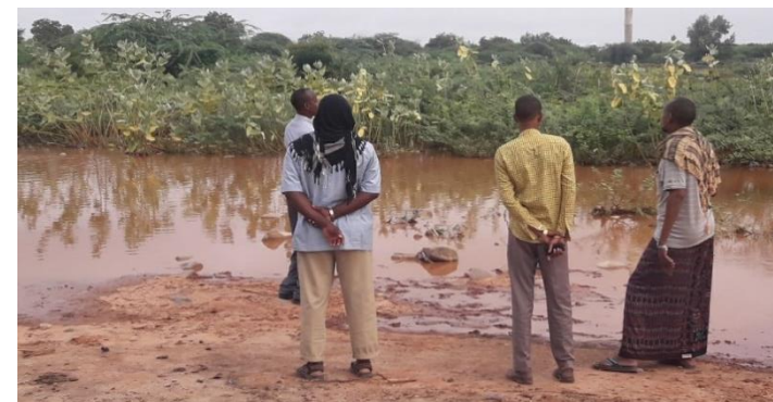
Sarinley road to Bardera market to access or purchase daily base needs, October 22th 2019

Most cultivable land are underwater and agricultural equipment and infrastructure is damaged, including canals, culverts and irrigation pumps. The irrigated and established crops are destroyed by the floods and this in turn has impacted on low production and limited agriculture and labour opportunities. Farming inputs distribution is therefore highly recommended too.