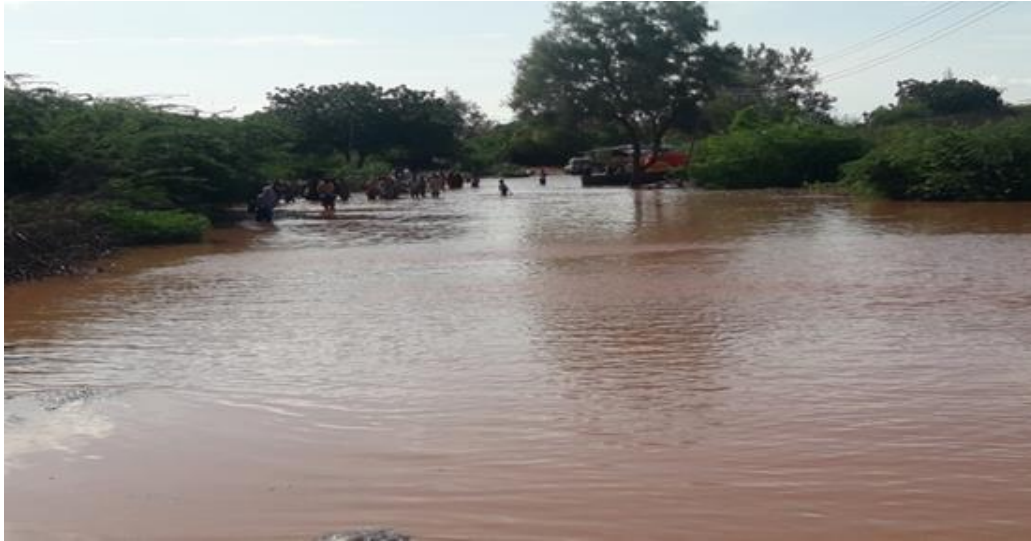
Village along the west bank of the river Juba cut off by the floods, 16 October, 2019