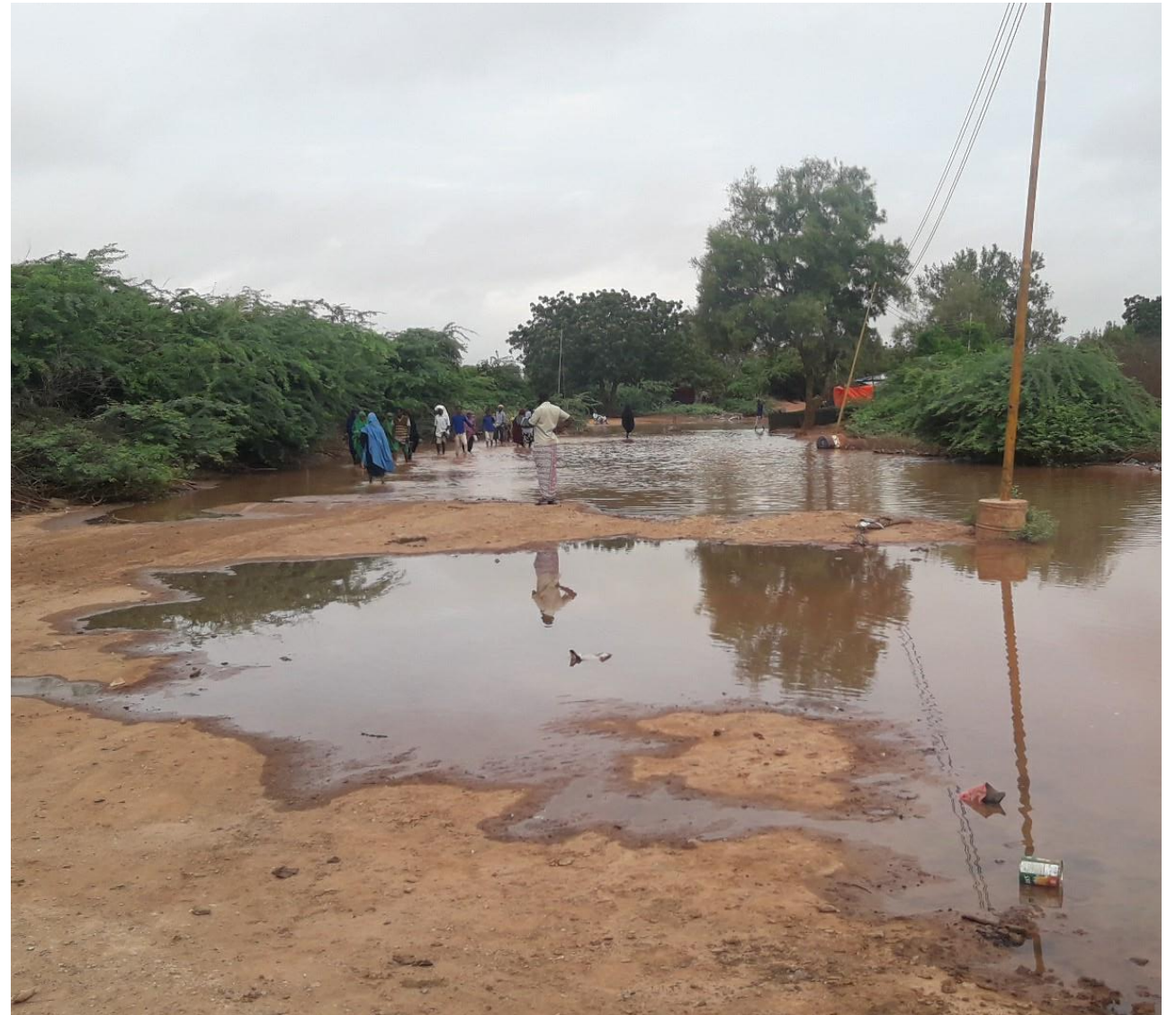
Bulo asharaf road to Bardera market near Bardera bridge, October 22 2019