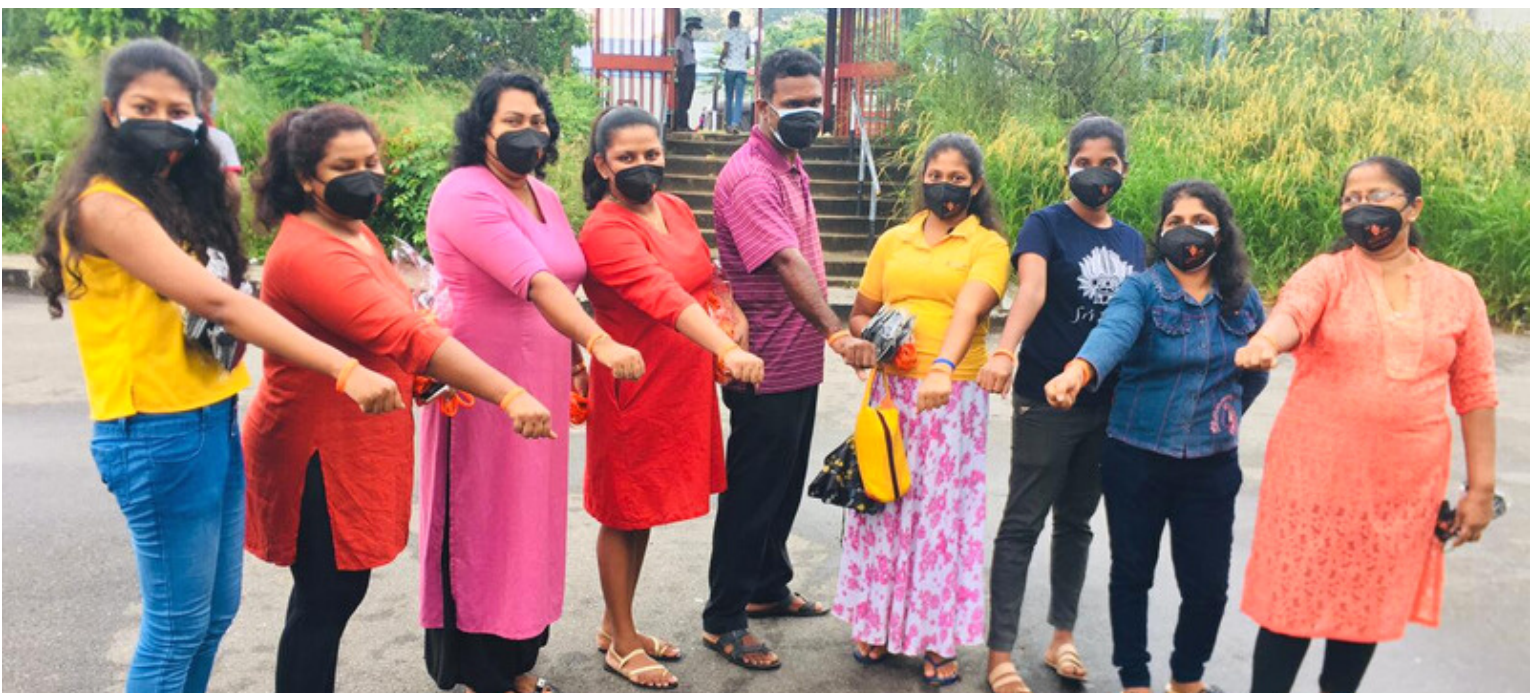
Campaigns organised in support of the 16 Days of Activism aimed at preventing GBV against female garment workers