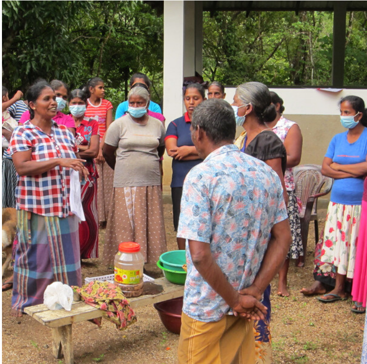
Through the COLIBRI project over 50 farmers in the Knuckles Conservation Forest were trained and supported to adopt sustainable agricultural practices

individuals engaged in activities to promote social cohesion and coexistence among communities