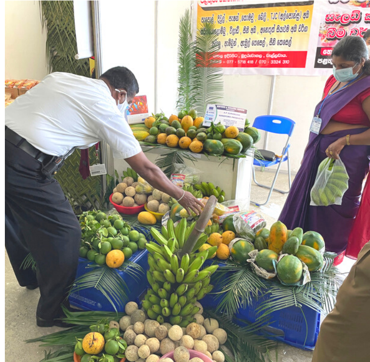
Over 200 MSMEs participated in trade forums and fairs to strengthen market linkages via the Integrated Economic Development project