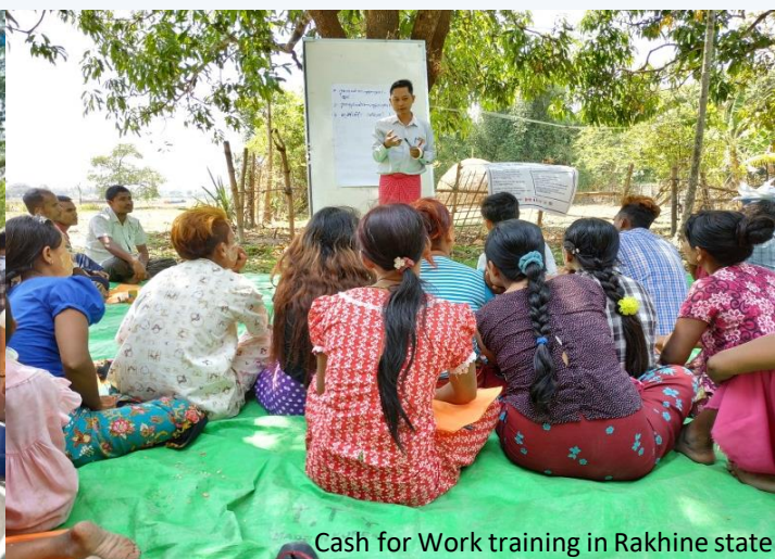
Cash for Work training in Rakhine state