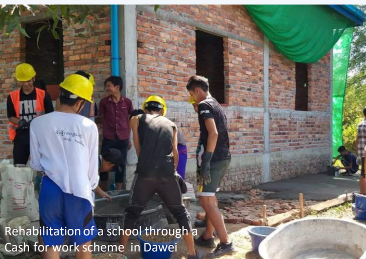
Rehabilitation of a school through a Cash for work scheme in Dawei

Furthermore, Myanmar is one of the most disaster-prone countries in Asia. It ranks third out of 187 countries in the Global Climate Risk Index. Historical data shows that medium to large-scale natural disasters occur every few years. Since 2002, more than 13 million people have been affected by natural disasters, including three Category 4 cyclones, several major earthquakes, and severe flooding.