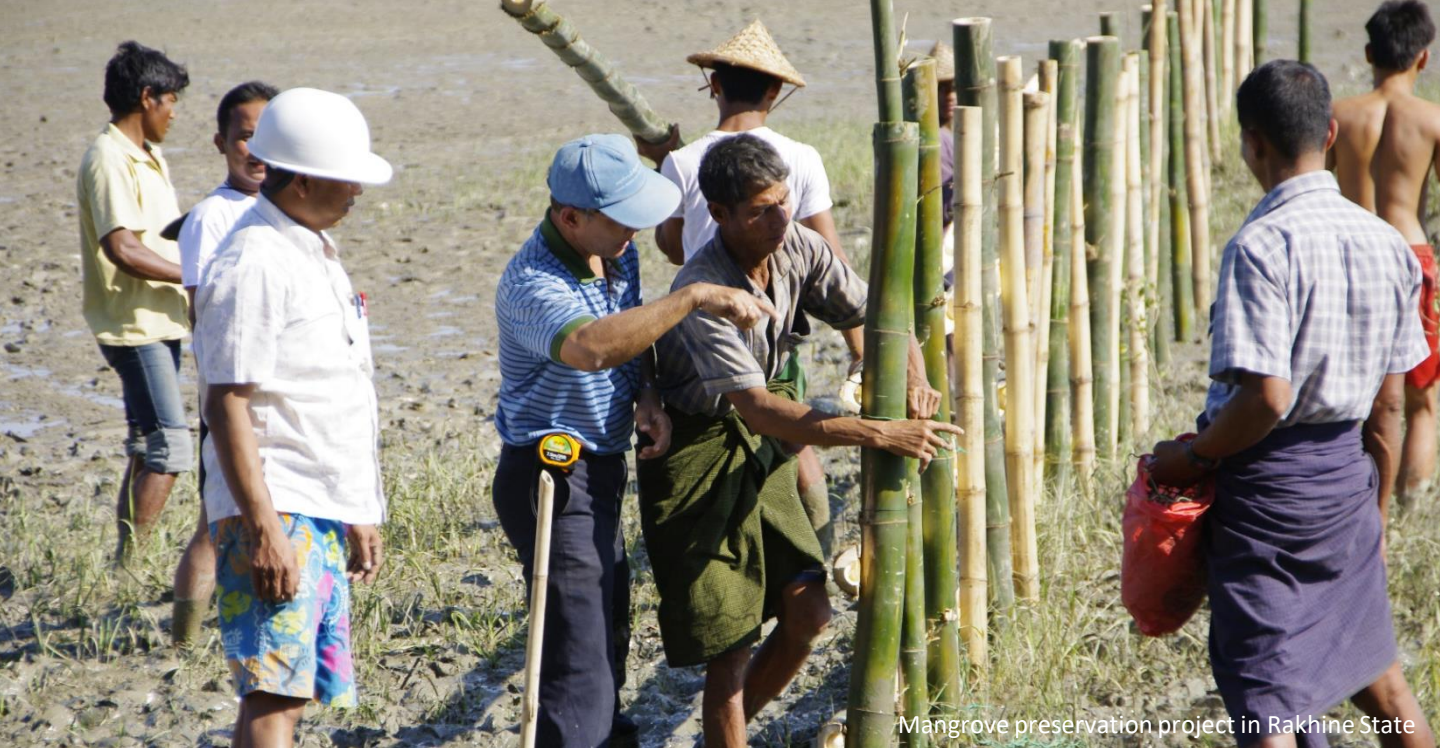
Mangrove preservation project in Rakhine State