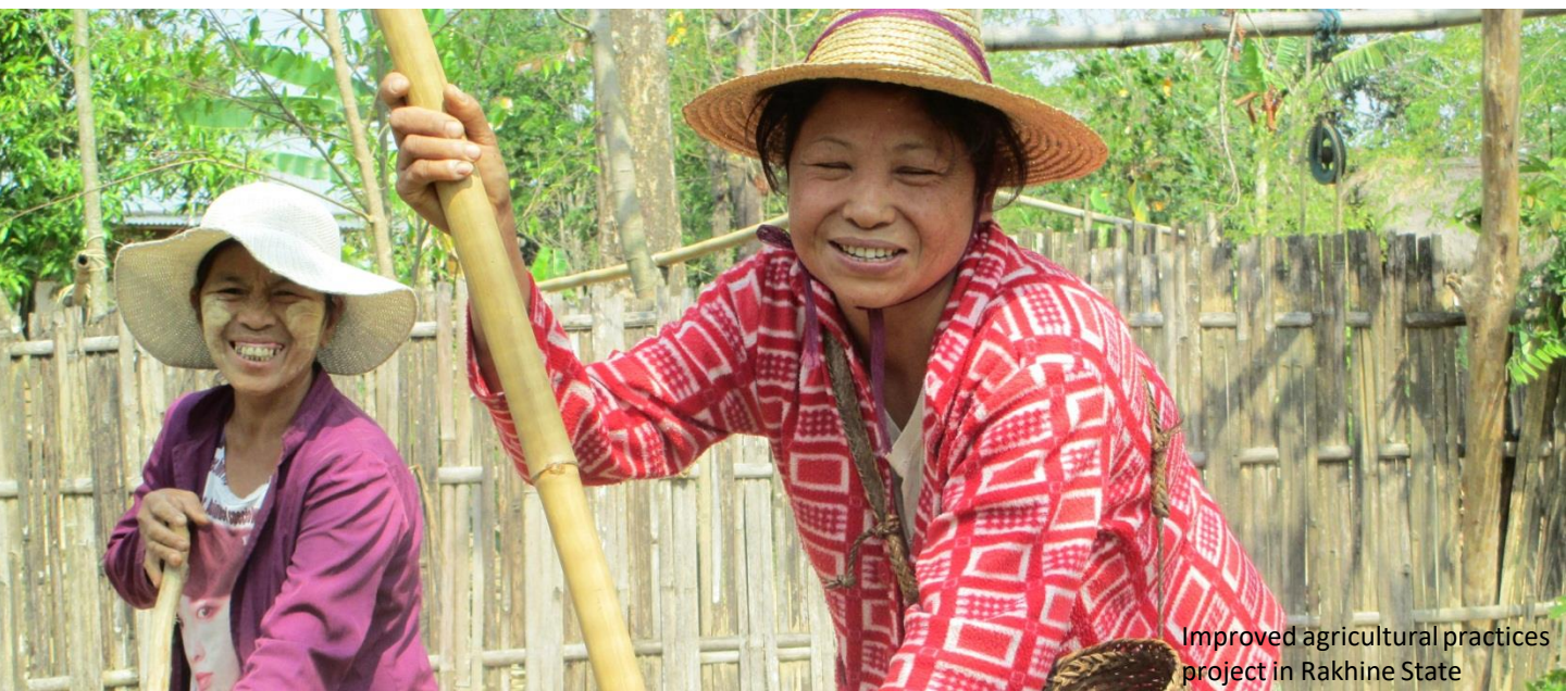
Improved agricultural practices project in Rakhine State