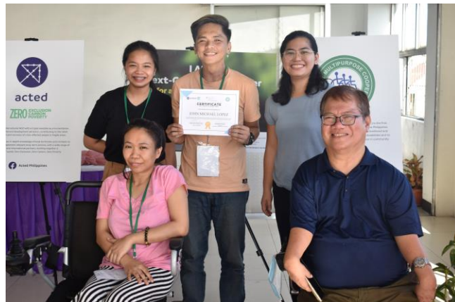
Youth leadership programme, March 2024