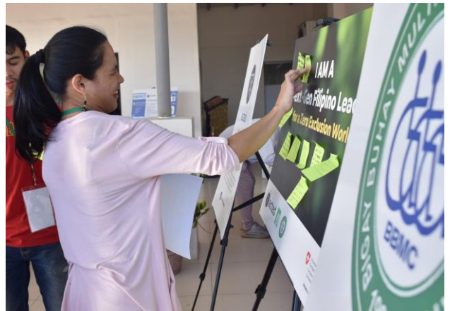
Youth leadership programme, March 2024

To address the critical need for greater inclusion of persons with disabilities, Acted and BBMC therefore decided to collaborate on a new project to strengthen leadership among young persons with disabilities and build connections between Manila and BARMM , aiming to enhance advocacy and inclusive opportunities across the Philippines .