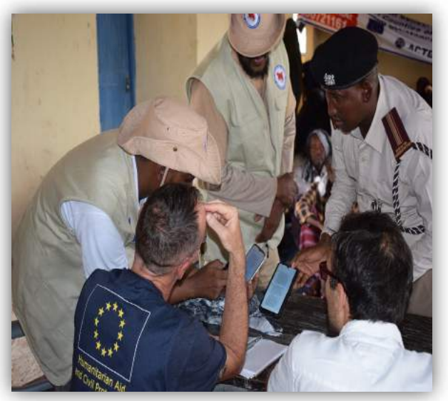
DG-ECHO on a monitoring session with AHN members in Garissa County

The Arid and Semi-Arid (ASAL) region in Northern Kenya is ravaged annually by cyclic shocks including drought, flash floods and most recent the desert locus invasion affecting the social economic status of vulnerable communities. To address the immediate humanitarian needs, the Kenya Cash Consortium (KCC) - composed of the ASAL Humanitarian Network (AHN), ACTED, Concern Worldwide. Oxfam. and IMPACT Initiatives implements multi-purpose assistance-based projects to address the basic needs and support the recovery of affected households. in Garissa County